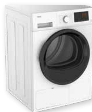
8kg Heat Pump TCD80ASHAG