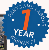
18.5" PURE TV - 12 VOLT