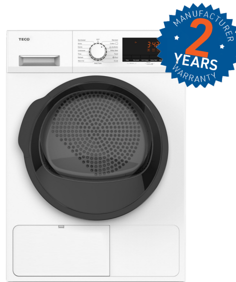
TECO Auto Sensing Dryers 8kg Auto Sensing Heat Pump