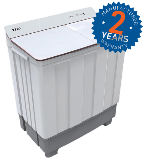
TECO Twin Tub Washing Machines 10kg Twin Tube