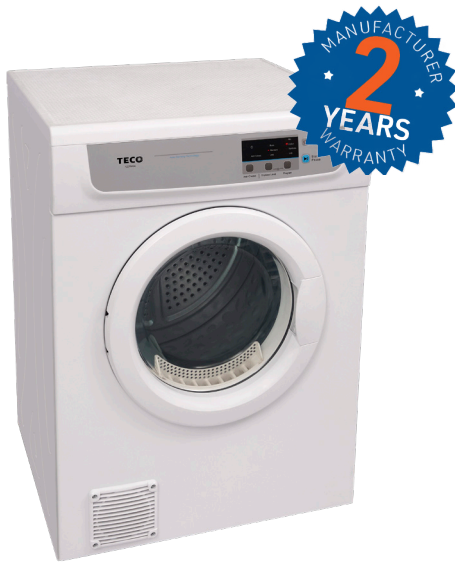
TECO Auto Sensing Dryers 7kg Auto Sensing Vented