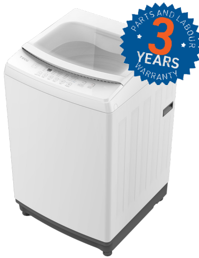
TECO Top Load Washing Machines From 5.5kg Compact to 10kg Family