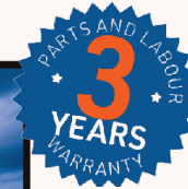
23.6" SMART TV