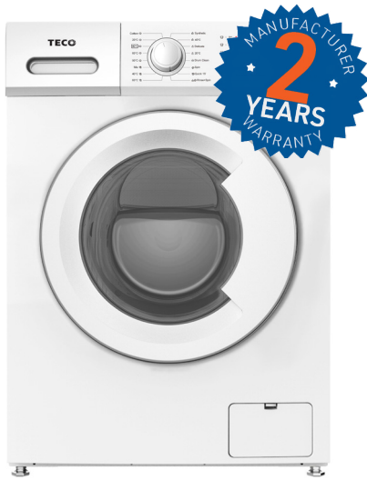
TECO Front Load Washing Machines From 6kg Compact to 8kg Family

Transforming Laundry with Smart and Efficient Solutions.